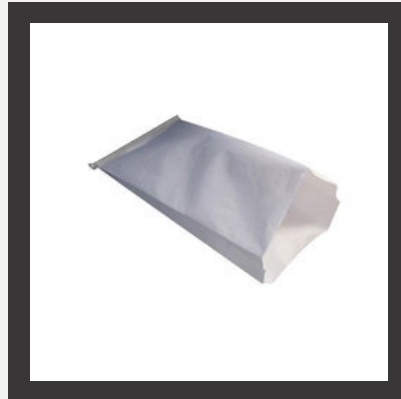
HDPE Laminated Centre Sealed White Paper Bag