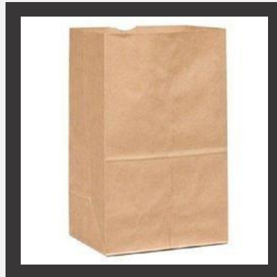
Brown Grocery Paper Bag