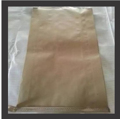
HDPE Laminated Paper Bag