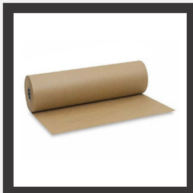
HDPE Laminated Paper Roll