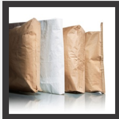
Multiwall Paper Bag