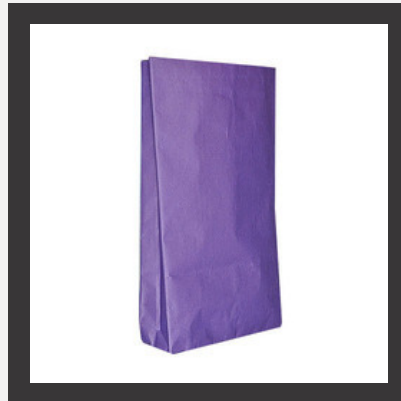
Plain Multiwall Paper Bag