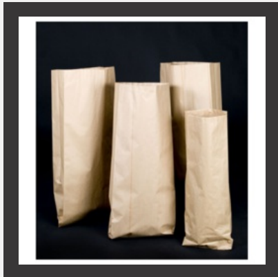
Multiwall Paper Bags