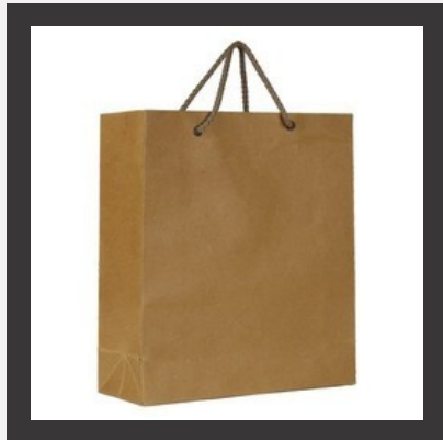
Shopping Paper Bag