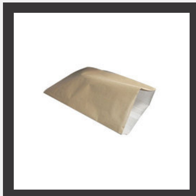
HDPE Laminated Kraft Paper Bag