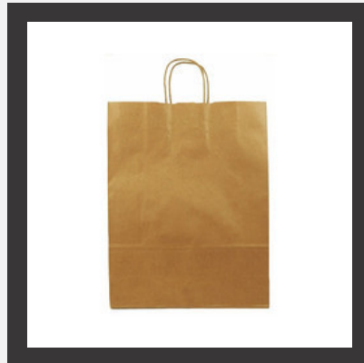
Plain Paper Bag