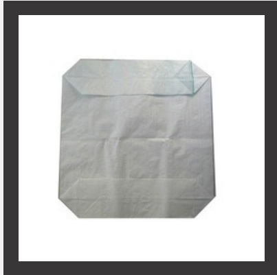
Pasted Valve Bag