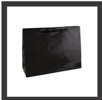
Laminated Paper Bags