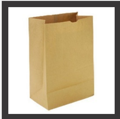
Brown Paper Bag