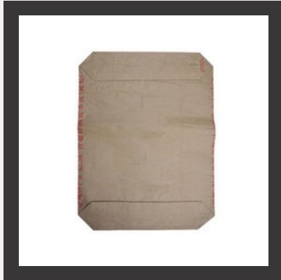
Valve Type Paper Bag