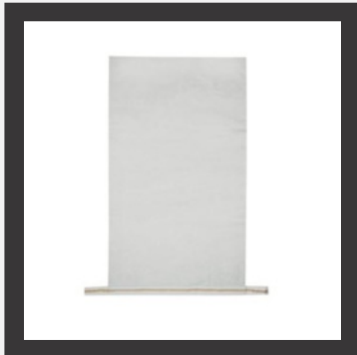
Multiwall White Paper Bag