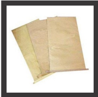
HDPE Laminated Centre Sealed Brown Paper Bag