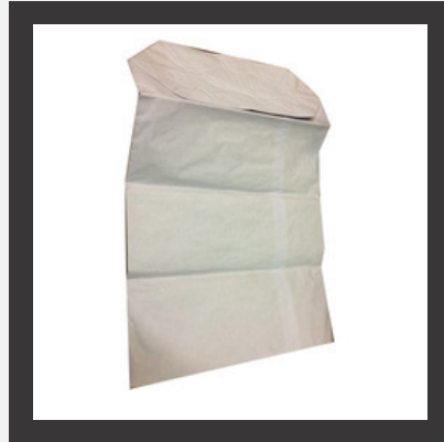
Plain Valve Paper Bag