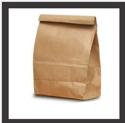
Food Packaging Paper Bag