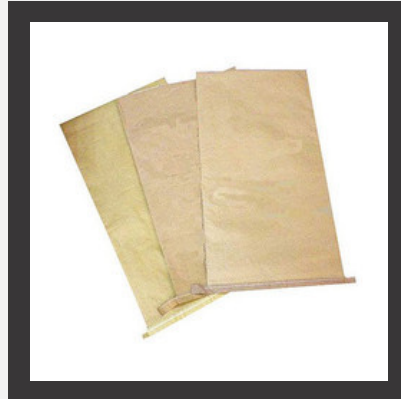
HDPE Laminated Kraft Paper Bag